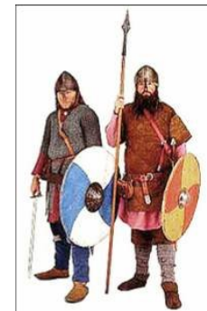
Skjold means "shield".