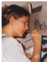
Learning røsemaling (Norwegian painting) at summer language camp

Each month we have a brief business meeting, our program for the day, and food, beverages, fellowship, and good conversation.