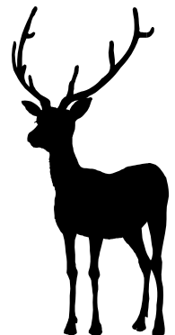
ELK North America