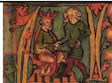
Harald Fairhair or Harald Finehair (Old Norse: Haraldr hárfagri, Norwegian: Harald Hårfagre), (c. 850 – c. 933) was the first king (872 – 930) of Norway. Picture: King Harald, in an illustration from the 14th century Flateyjarbók.

Little is known of the historical Harald. The only contemporary sources mentioning him are the two skaldic poems Haraldskvæði and Glymdrápa, by Þorbjörn Hornklofi. The first poem describes life at Harald's court, mentions that he took a Danish wife, and that he won a victory at Hafrsfjord. The second relates a series of battles Harald has won. He is not mentioned in any contemporary foreign sources. His life was described in several of the Kings' sagas, but the first of these were not written until the end of the 12th century, over 250 years after his death. Their accounts of Harald and his life differ on several points, and much of the content is clearly mythological. He is credited with having unified Norway into one kingdom. Modern historians assume that his rule was limited to the coastal areas of southern Norway.