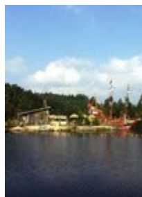
Kristiansand Zoo and Amusement Park

Bø Sommarland is the country's biggest water-park and one of the most popular attractions in the Telemark area. Visitors can while away the hours in the park's extensive number of pools where slides of varying height and length provide thrills for children and adults alike. A dry area includes a playground with mini-golf, a climbing mountain, a stage with clown shows and an entertainment centre called Las Bøgas which features a fun fair, casino and show stage with live performances.